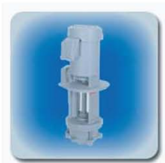
VKS Series (flow-rate type)