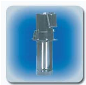
VKP Series (pressure type)