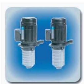
VKA Series (pressure and flow-rate types)