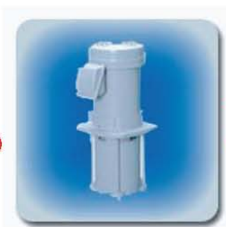
VKR Series (pressure type)