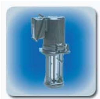
VKP Series (flow-rate type)