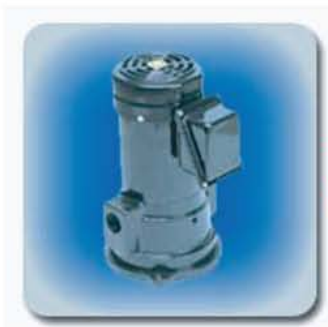
VKN Series (pressure type)