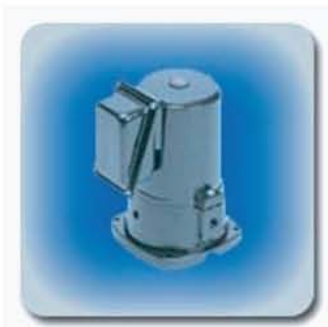
VKN Series (flow-rate type)