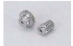
Fairloc Hub Gears (SUSL)