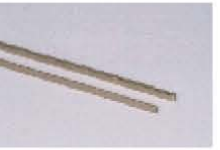
Brass Racks (BSR)