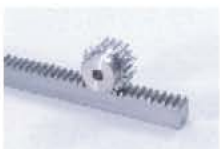
CP Stainless Steel Gears (SUSCP)