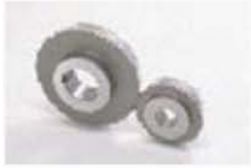
Ground Spur Gears (MSGA)