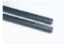
Round Racks (SRO(S))