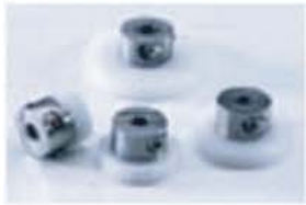
Fairloc Hub Acetal Spur Gears (DSL)