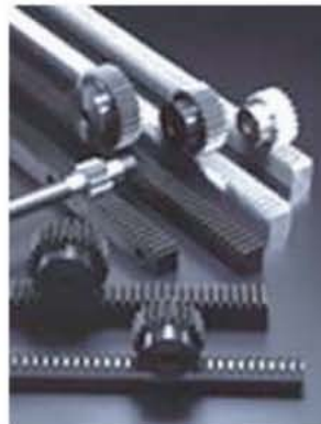
CP Racks & Pinions