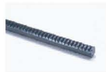
CP Round Racks (SROCP)