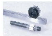
CP Ground Spur Gears (SSCPG)