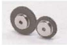
Plastic Spur Gears with Steel Core (NSU)