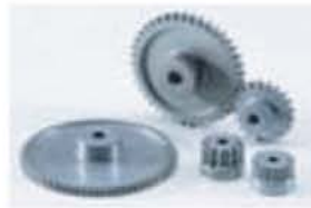
Sintered Metal Spur Gears (LS)