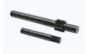
Spur Pinion Shafts (SSS)