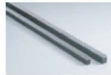
CP Ground Racks (SRGCP(F))