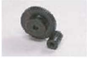
Steel Spur Gears (SS)