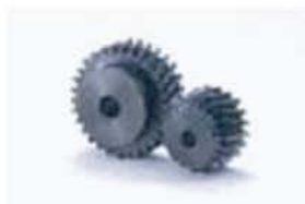
Helical Gears (SH)