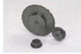
Steel, Thin Face Spur Gears (SSY)