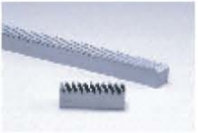
Ground Helical Racks (KRHG(F))