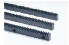
CP Racks (KRCPF)