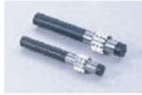
Ground Spur Pinion Shafts (SSGS)