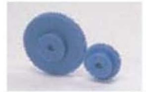
Plastic Spur Gears (PS PSA)