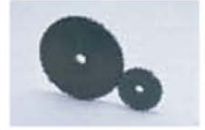
Steel, Hubless, Thin Face Spur Gears (SSAY)