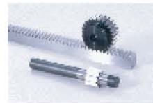
CP Ground Racks (KRGCP(F)(D))