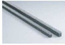
Ground Racks (SRG(F))