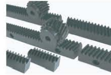
Helical Racks (SRH(F)(D))