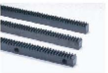
CP Racks (SRCPF(F)(D))