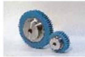
Plastic Spur with Stainless Steel Core (PU)