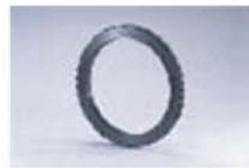
Steel Ring Gears (Spur Gears) (SSR)