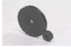
Steel, Hubless Spur Gears (SSA)