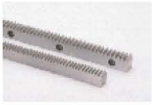
Ground Racks (KRG(F)(D))