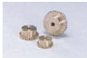
Brass Spur Gears (BSS)