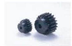
CP Spur Gears (SSCP)