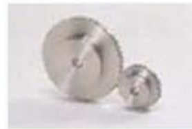
Stainless, Steel, Spur Gears (SUS SUSA)