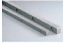
Stainless Steel Racks (SUR(F)(D))