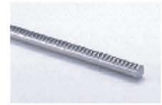
Round Racks (SURO)