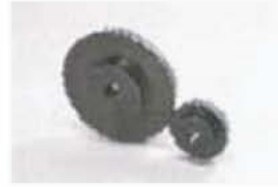
Ground Spur Gears (SSG)