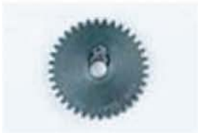
SSAY Stock Gears with K-Clamps