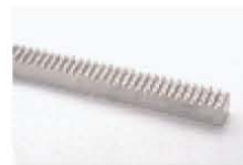
CP Stainless Steel Racks (SURCPF(D))