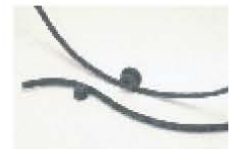
CP Metal Flexible Racks (FRCP)