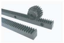
CP Tepered Racks (STRCPF(D))