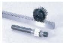
CP Ground Spur Gears (SSCPGS)