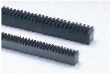
Racks with Machined Ends (SRF)