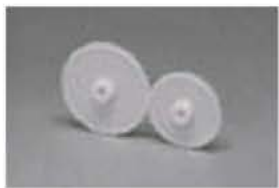
Injection Molded Spur Gears (DS)