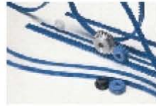
Molded Flexible Racks (DR)