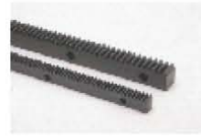
Racks with Bolts Holes (SRFD/SRFK)