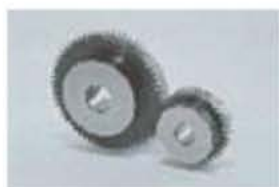
Ground Helical Gears (KHG)